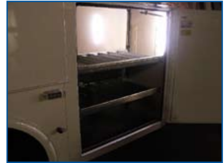
Can be mounted horizontally or vertically. Slim profile designed to fit into tight spaces.